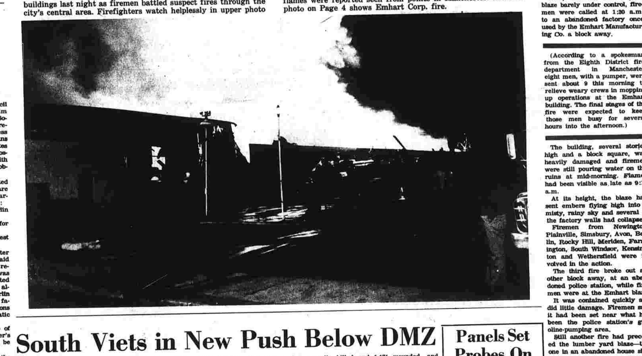
Flames roar uncontrolled over New Britain Lumber Company buildings last night as firefighters watch helplessly in upper photo but soon brought the blaze under control. At left firefighters in the city's central area. Firefighters watch helplessly in upper photo but soon brought the blaze under control. At left firefighters in the city's central area. Firefighters watch helplessly in upper photo but soon brought the blaze under control. At left firefighters in the city's central area.

NEW BRITAIN (AP) — Firemen fought two spectacular — and suspicious — fires in New Britain on Thursday morning and quickly doused a third fire in an abandoned police station.