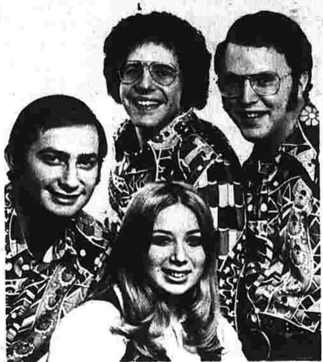
Perform for USY Sunday